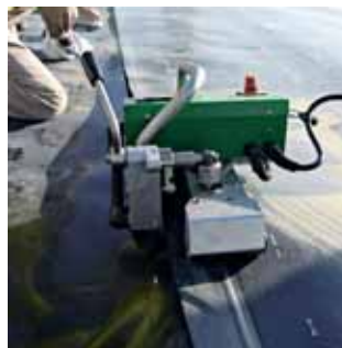
Fast and perfect!