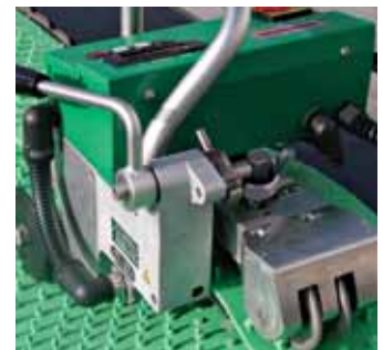
Special version for concrete protective liners.