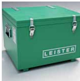
Storage case for perfect protection.