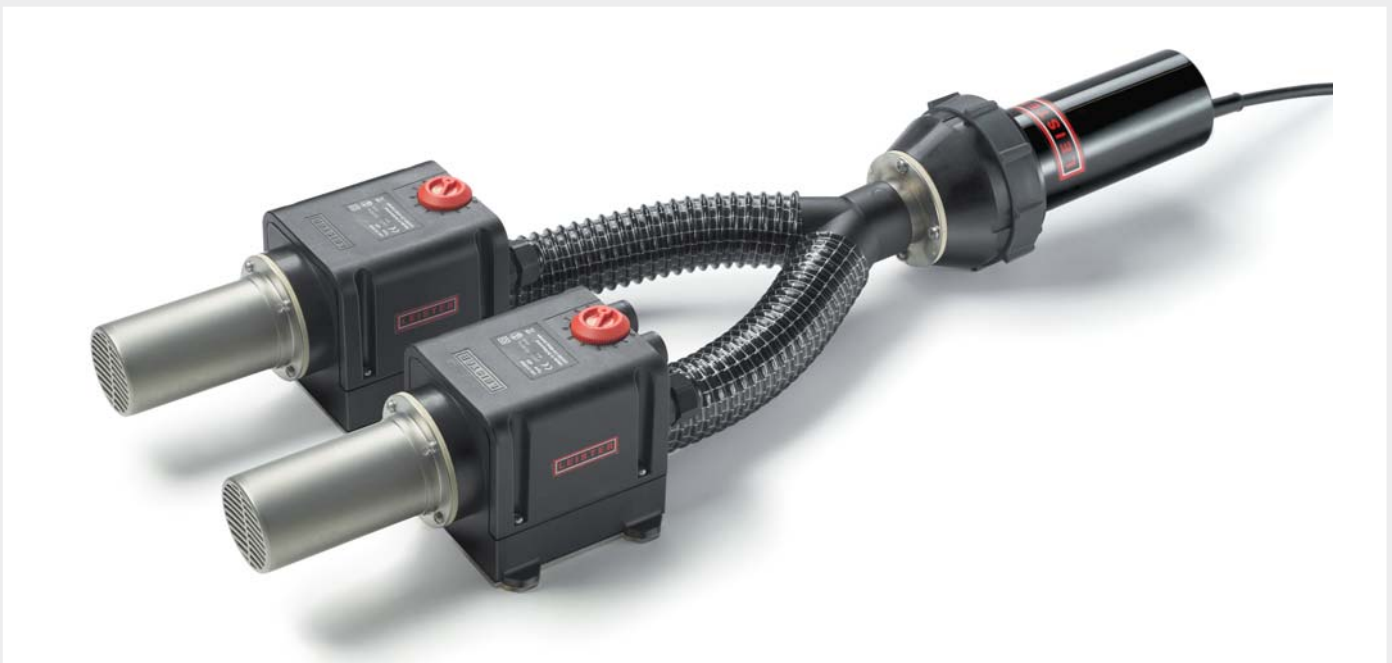
The new MONO compact blower serves as air supply for Leister air heaters. Pictured here for two LHS 40 S units

adapted installations. The MONO can be easily mounted with two screws in the supplied mounting bracket. If space is tight, the bracket can be dismantled. If the inlet air must be drawn externally, an optional air adapter is available.