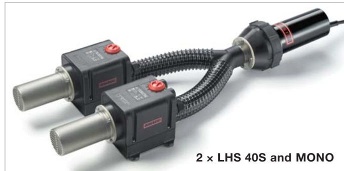
2 x LHS 40S and MONO