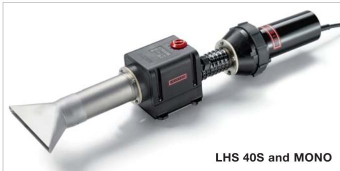
LHS 40S and MONO