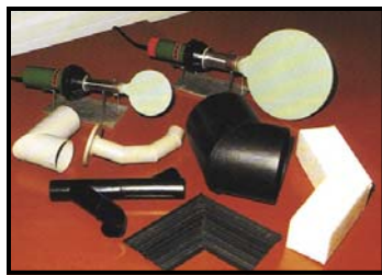
Pipe butt welding with mirrors