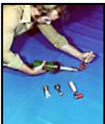
Tarps & Liners